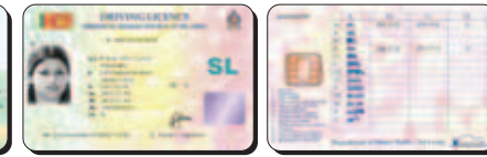
Sri Lanka Driving Licence