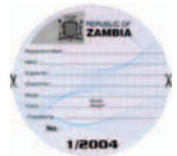
Zambia Vehicle Licence Disc