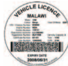
Malawi Vehicle Licence Disc