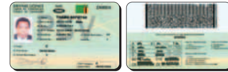
Zambia Driving Licence