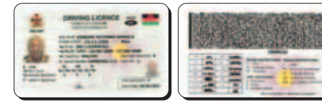
Malawi Driving Licence